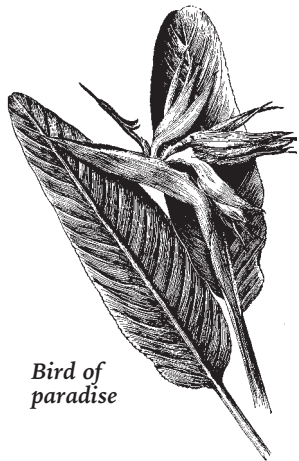
Bird of paradise

U054 Angel's Trumpet, Miniature NEW Lochroma australe Blue