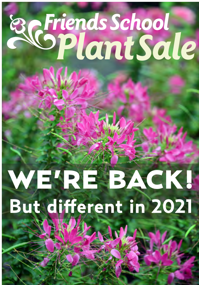
Spiderflower Cleome Cherry Queen.